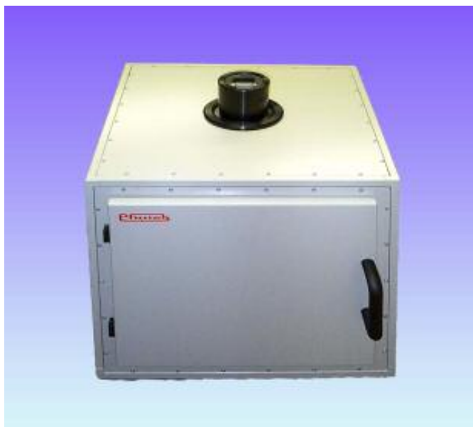
DB2 Dark Box