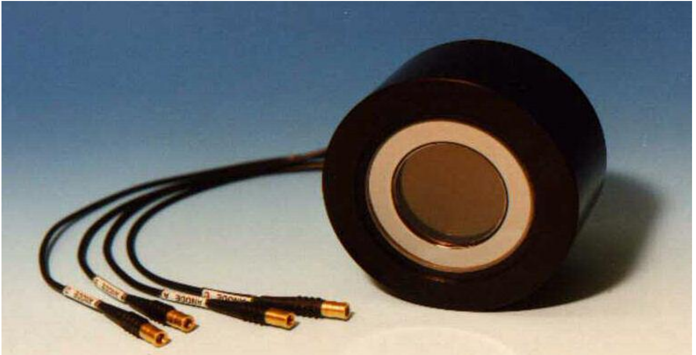
Photograph shows the IPD425